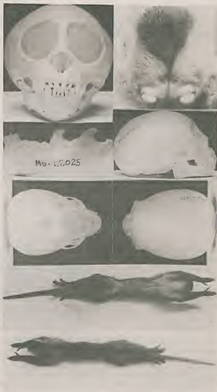
Figure 1. The holotype of Cebus kaapori sp.n. MPEG 22025. Stuffed skin and skull.